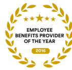
UAE Insurance Authority