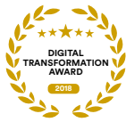
Digital Excellence Awards Cerebrum of the 3rd Annual Concierge