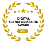
Digital Excellence Awards Cerebrum of the 3rd annual Conclave